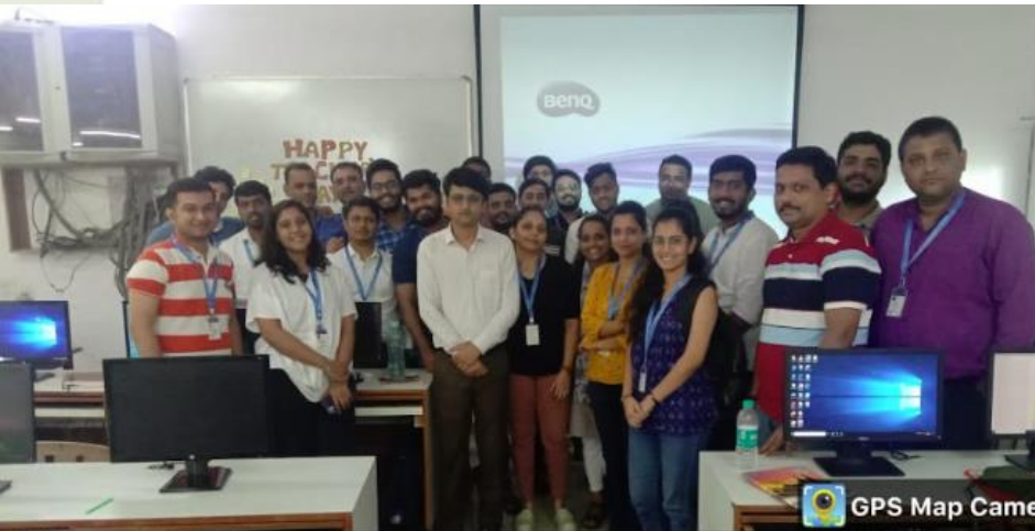
Mumbai, Maharashtra, India 3VF4+CR5, Kolivery Village, University of Mumbai, Vidya Nagari, Kalina, Santacruz East, Mumbai, Maharashtra 400098, India Lat 19.073501° Long 72.857137° 10/09/23 11:23 AM GMT +05:30