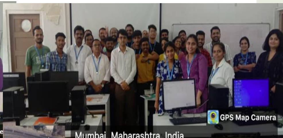
Mumbai, Maharashtra, India 3VF4+RM7, Kolivery Village, University of Mumbai, Vidya Nagari, Kalina, Santacruz East, Mumbai, Maharashtra 400098, India Lat 19.07436° Long 72.856656° 10/09/23 01:08 PM GMT +05:30